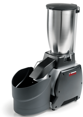
Sirman Ice Crusher , model Nordkapp :

Authorized Distributor: FOODSERVICE EQUIPMENT MARKETING 10 CARRON PLACE-KELVIN IND. ESTATE G75 0YL GLASGOW() TEL./FAX. 0044-1355 244111 / 0044-1355 241471 E-mail:saganm@fem.co.uk