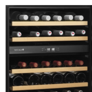
Wooden drawing shelves