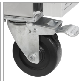
Strong wheels as option