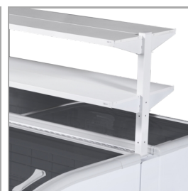
Promotional shelves as accessory