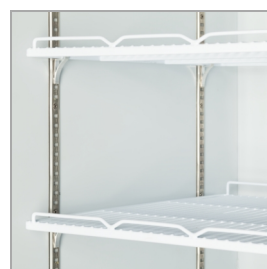
Adjustable shelves behind each door