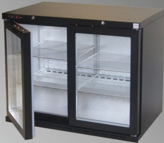
805mm Standard Height Range